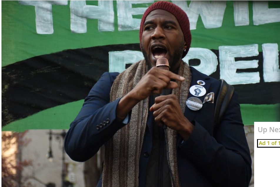
Public Advocate Jumaane Williams spoke out against the Willia Pipeline at rally held outside of City Hall on April 18.

The pipeline, by Oklahoma-based energy company Williams, would carry hydrofracked methane gas from Pennsylvania’s shale fields to New York City beneath the lower bay of New York Harbor. National Grid would use the fuel to heat homes in Staten Island, Queens, Brooklyn and Long Island.