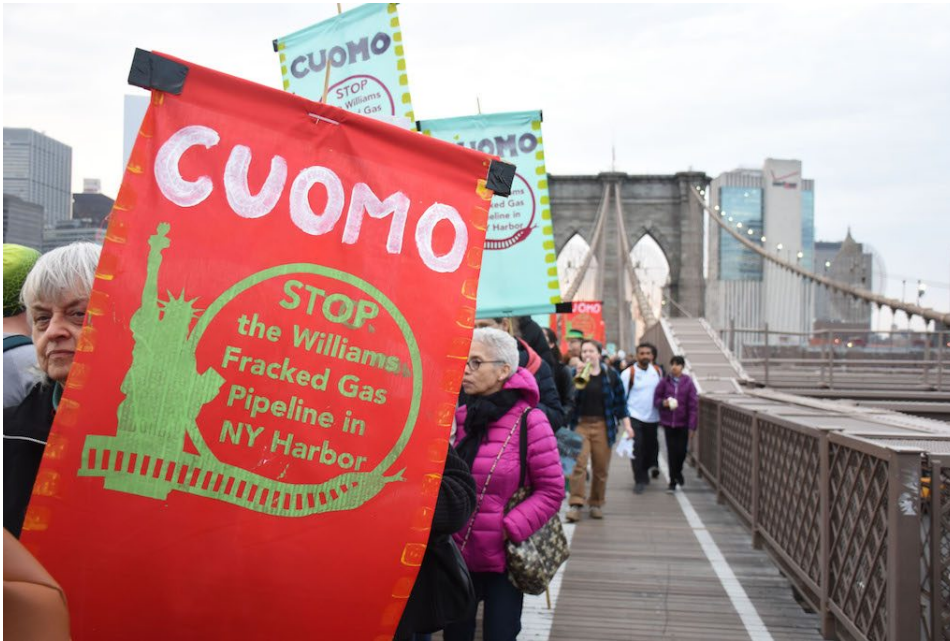
Protesters marched across the Brooklyn Bridge on April 18 as part of rally calling for Governor Cuomo to stop the proposed Williams Pipeline.

Up Next - RELATED NEWS: - Queens shooting spree: Person in ... X