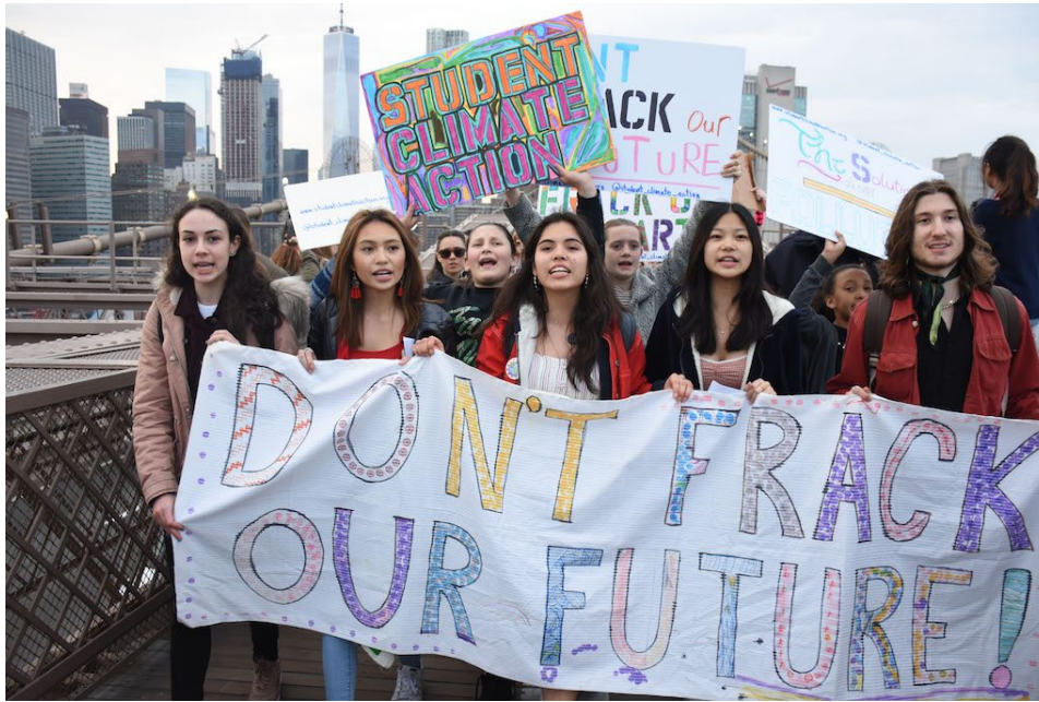
Young protesters called on Governor Cuomo to stop the Williams Pipeline as they marched across the Brooklyn Bridge on April 18